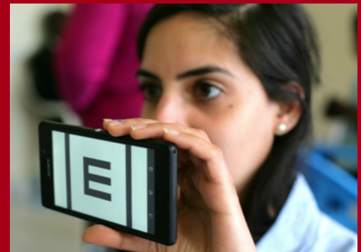
Peek Acuity - peekvision.org