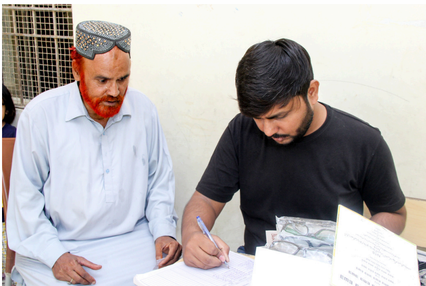
Registration process during the camp #WSD 2021