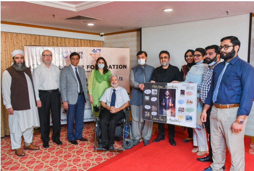
Group photo of one of the poster competition participants with the chief guest and panel of judges

We are pleased to share that the maximum level of participation was observed in the exhibition from all the eye health stakeholders. The youth were excited to be taking part in the poster competition and felt encouraged after receiving the 'World Sight Day 2021 Hero Award'