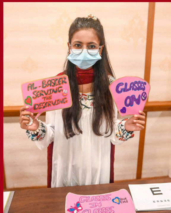
A young schoolgirl, being part of our glasses awareness campaign.