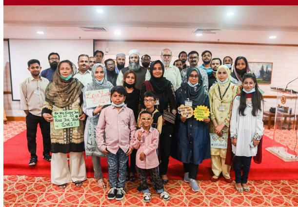
Group photo with children