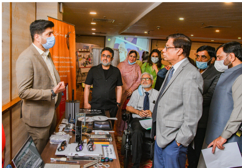
Awareness on rehabilitative services by setting up stalls for Low Vision Devices for persons/children with low vision