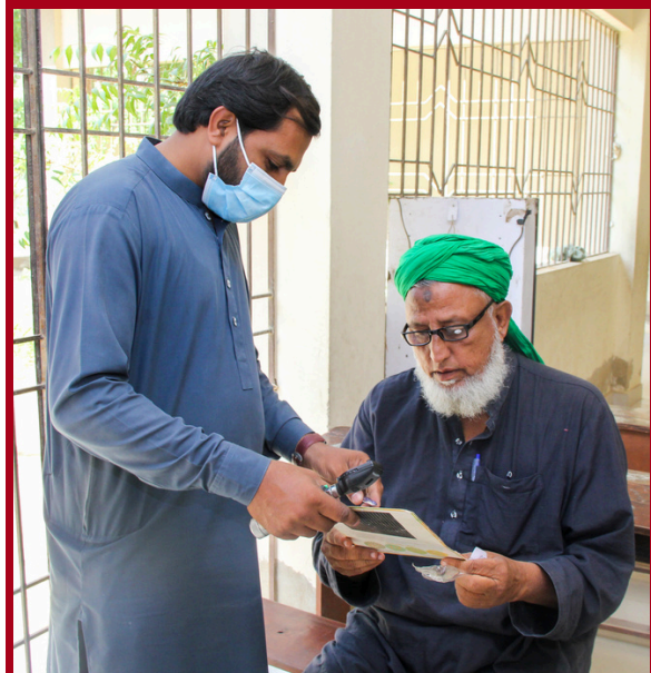
An old man while receiving near vision glasses during the camp