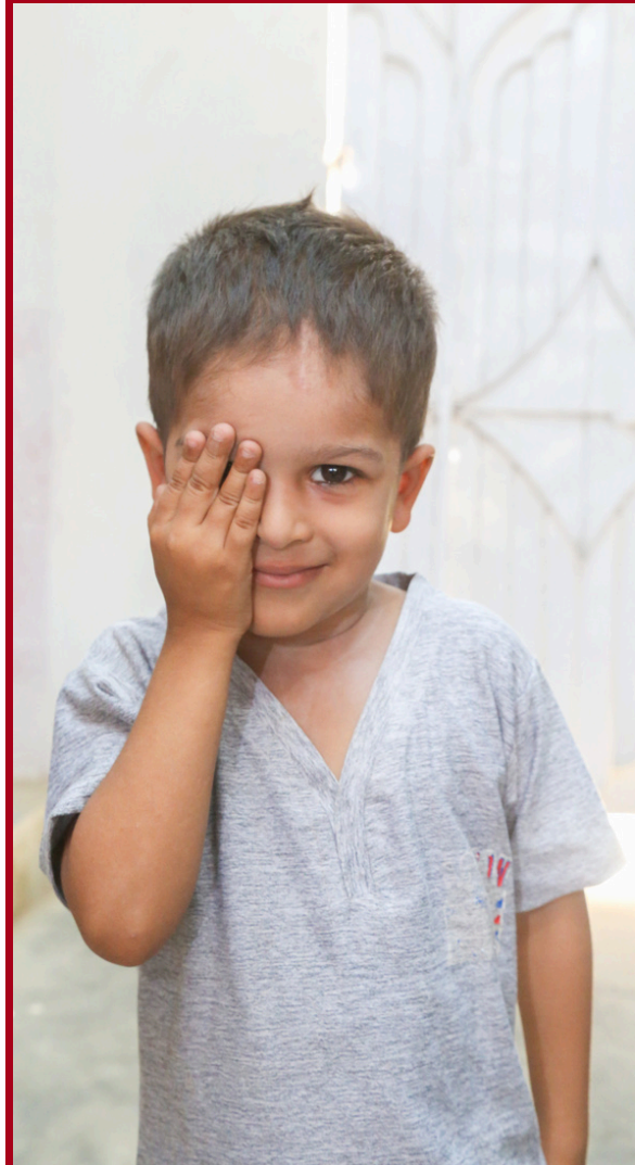
A happy child during eye screening. #WSD 2021 #LoveYourEyes