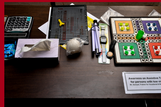
Assistive devices were displayed to create awareness on its usefulness for persons with low vision

STALL FOR ASSISTIVE TECHNOLOGY FOR BLIND OR LOW VISION PARTICIPANTS was organized to raise awareness on accessibility and rehabilitative services. Assistive devices included screen readers for blind individuals, screen magnifiers for low-vision computer users, video magnifiers, braille watches, and other devices for reading and writing with low vision.