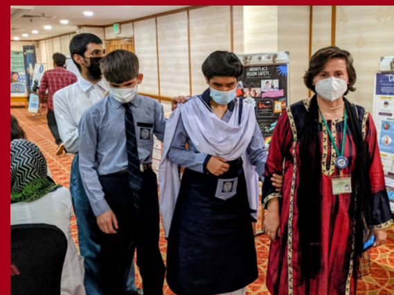
School teacher and children from Idareau Special School while visiting the exhibition