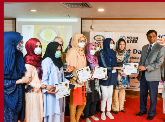
Winners of the poster competition while receiving the "World Sight Day 2021 Hero" awards