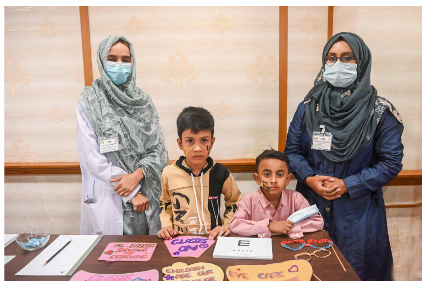
Al Baseer Optometry team who managed eyecare awareness activities with children

Activities concerning eye care awareness included vision screening, face painting, photography with eyecare probes & slogans.