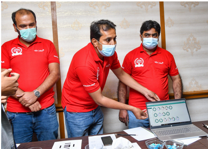
SIOVS team while presenting the functionality and usefulness Peek technology

STALL FOR ASSISTIVE TECHNOLOGY FOR BLIND OR LOW VISION PARTICIPANTS was organized to raise awareness on accessibility and rehabilitative services. Assistive devices included screen readers for blind individuals, screen magnifiers for low-vision computer users, video magnifiers, braille watches, and other devices for reading and writing with low vision.